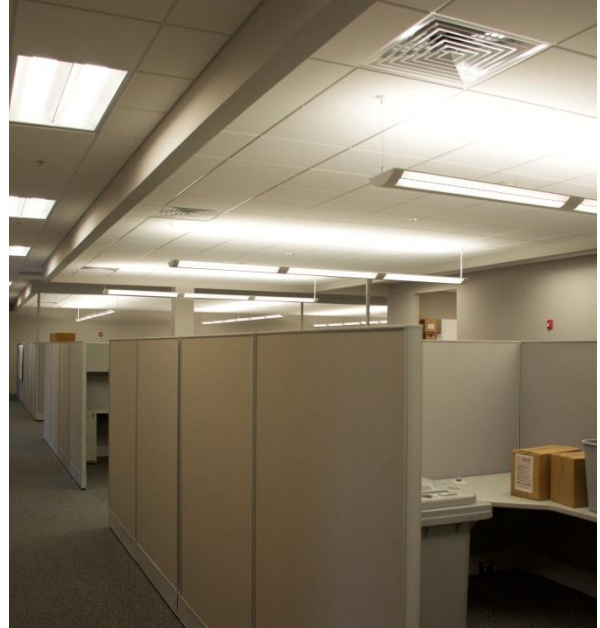
Open Cubical Area