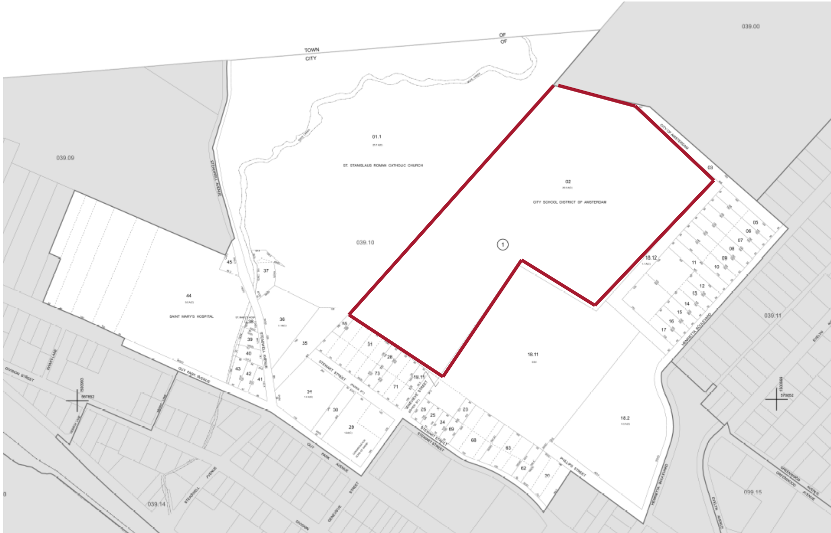
Approximate plot lines; subject to verification of survey