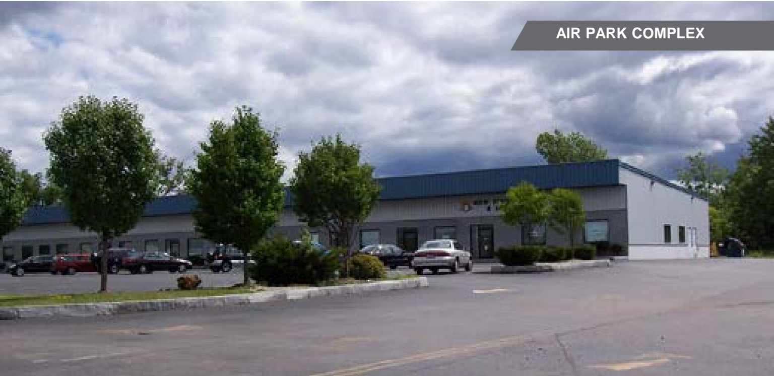
AIR PARK COMPLEX