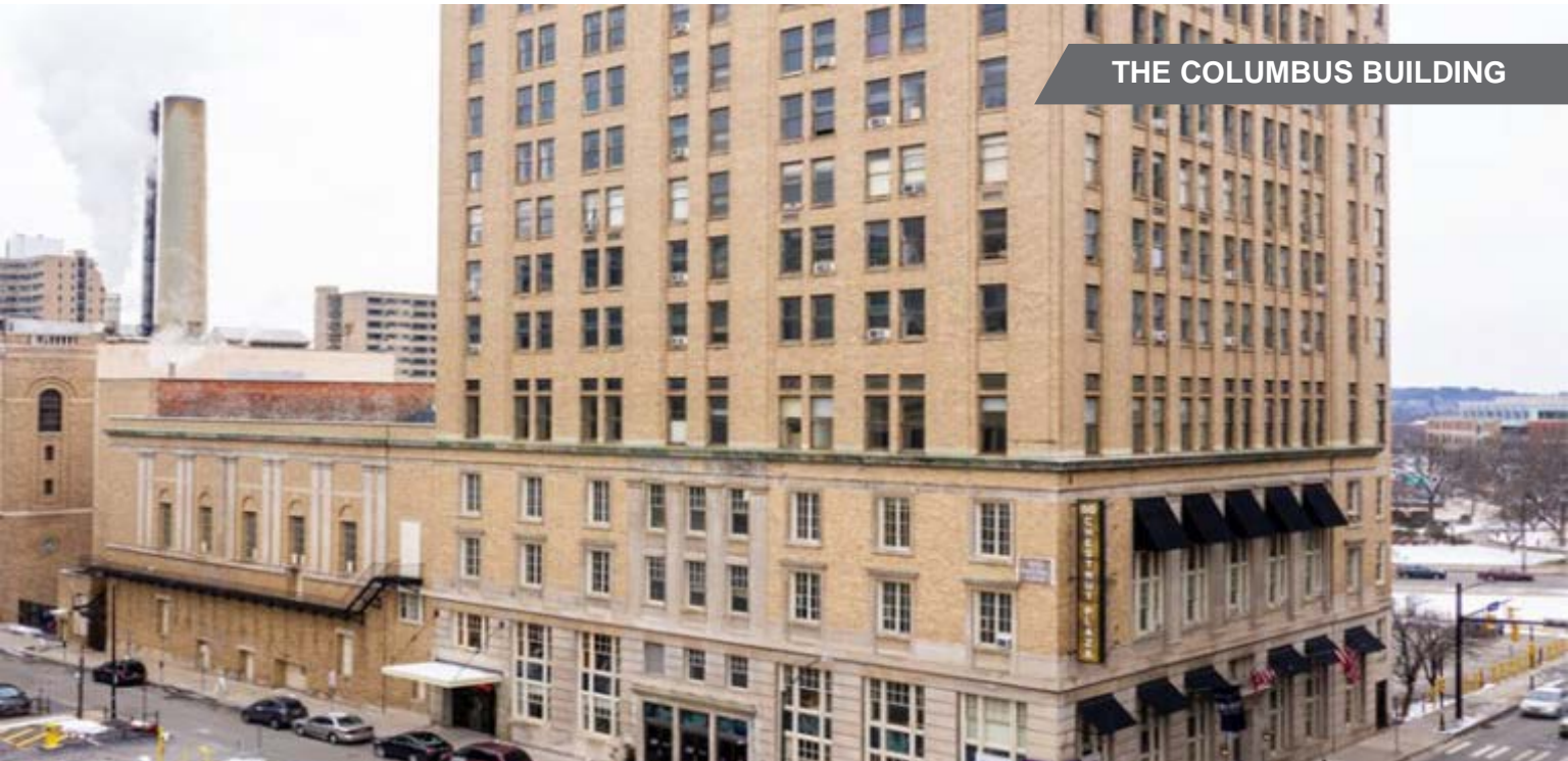
THE COLUMBUS BUILDING