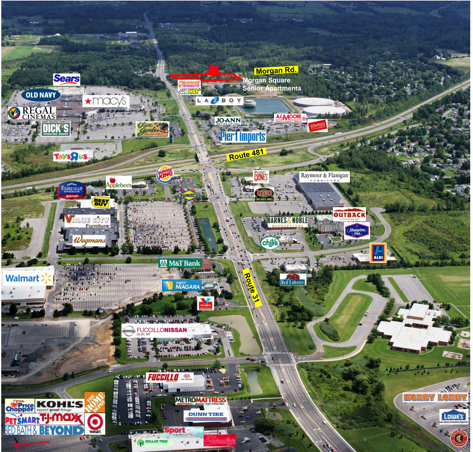
Route 31, Clay Retail Corridor