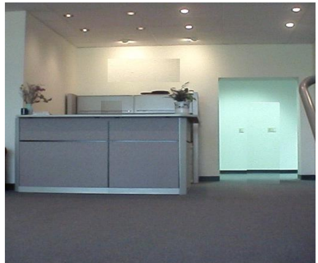
Large Welcoming Reception

Planning an office move? Have the office Move go as planned! Salina Industrial Powerpark provides full service, turn-key, options in a perfect location!