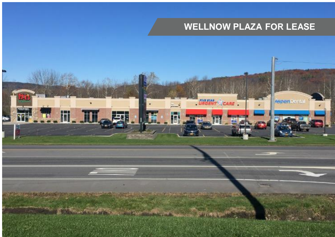
WELLNOW PLAZA FOR LEASE