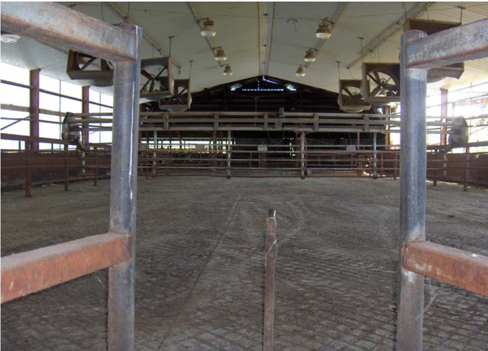
1,100 ± SF Free Stall Barn