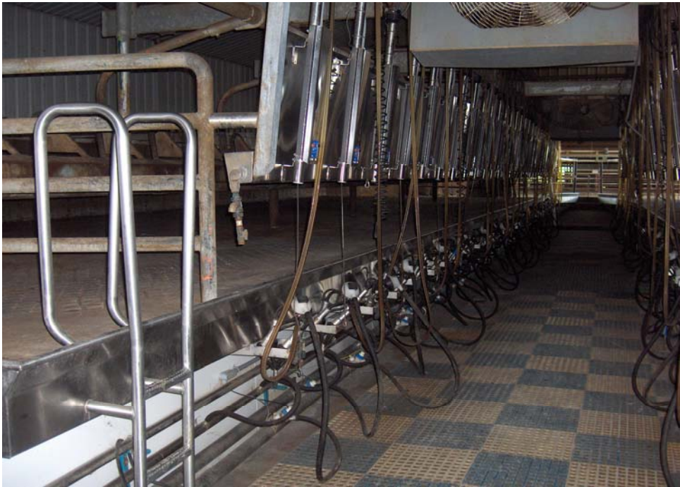
Double 30 Milkers