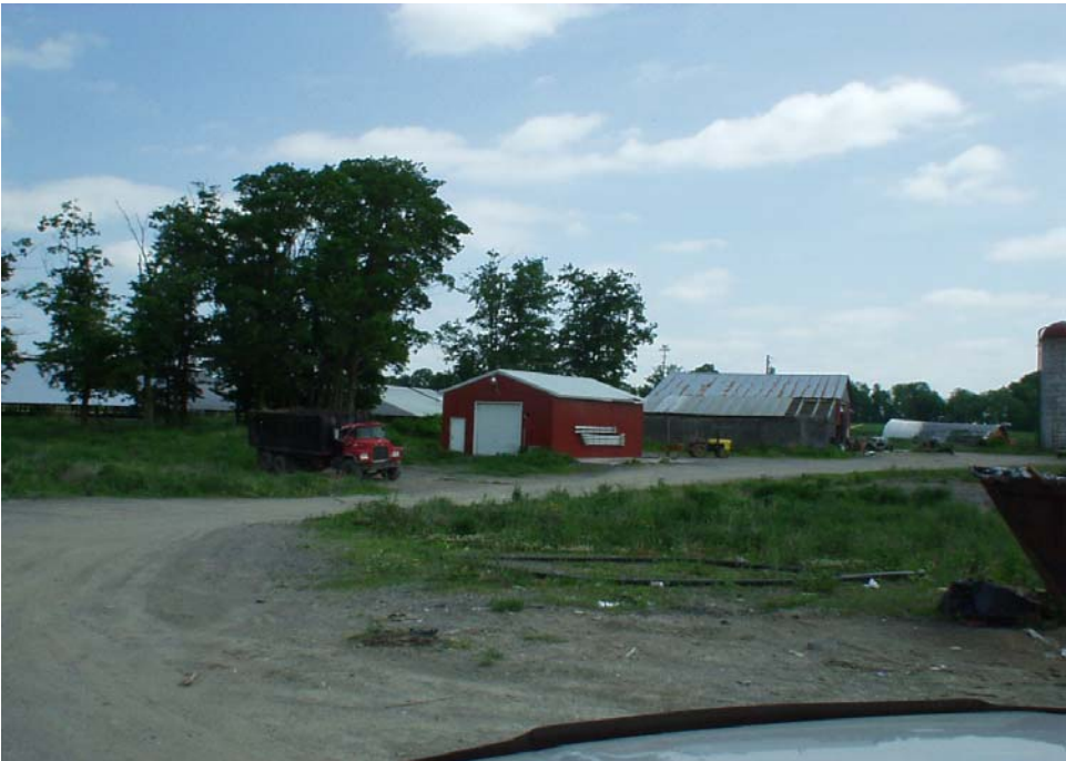
Dairy Support Buildings