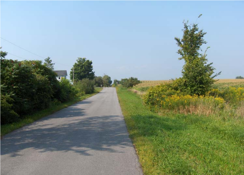
Seeber Road Looking North