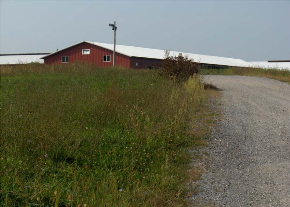
Dairy Farm-Milk Parlor