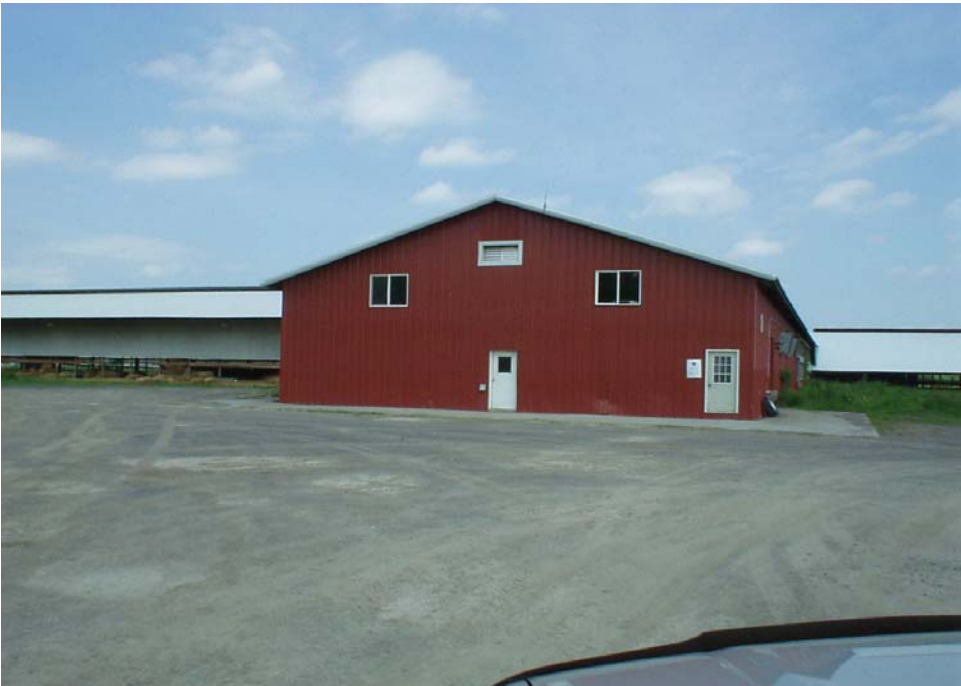
1,100 ± SF Free Stall Facility and Milk Parlor