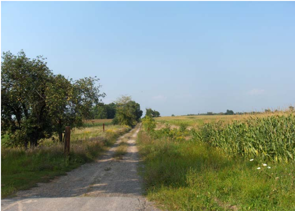
Flat, Tillable Land