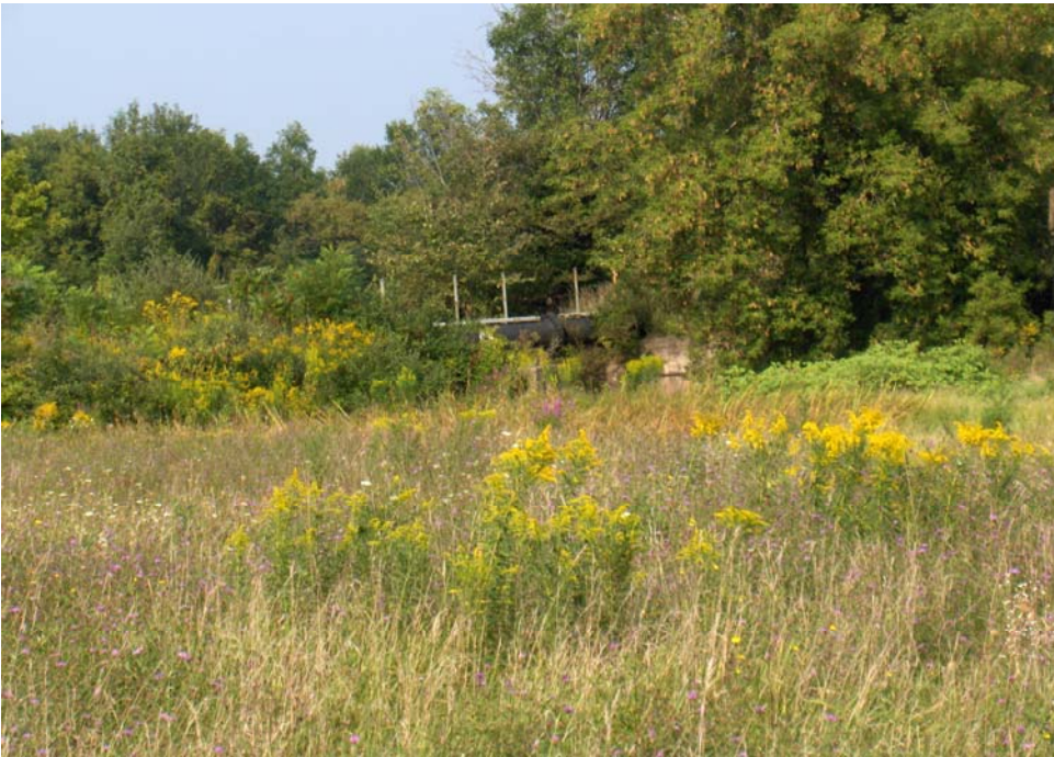
Natural Gas Pipeline-South of Subject Property