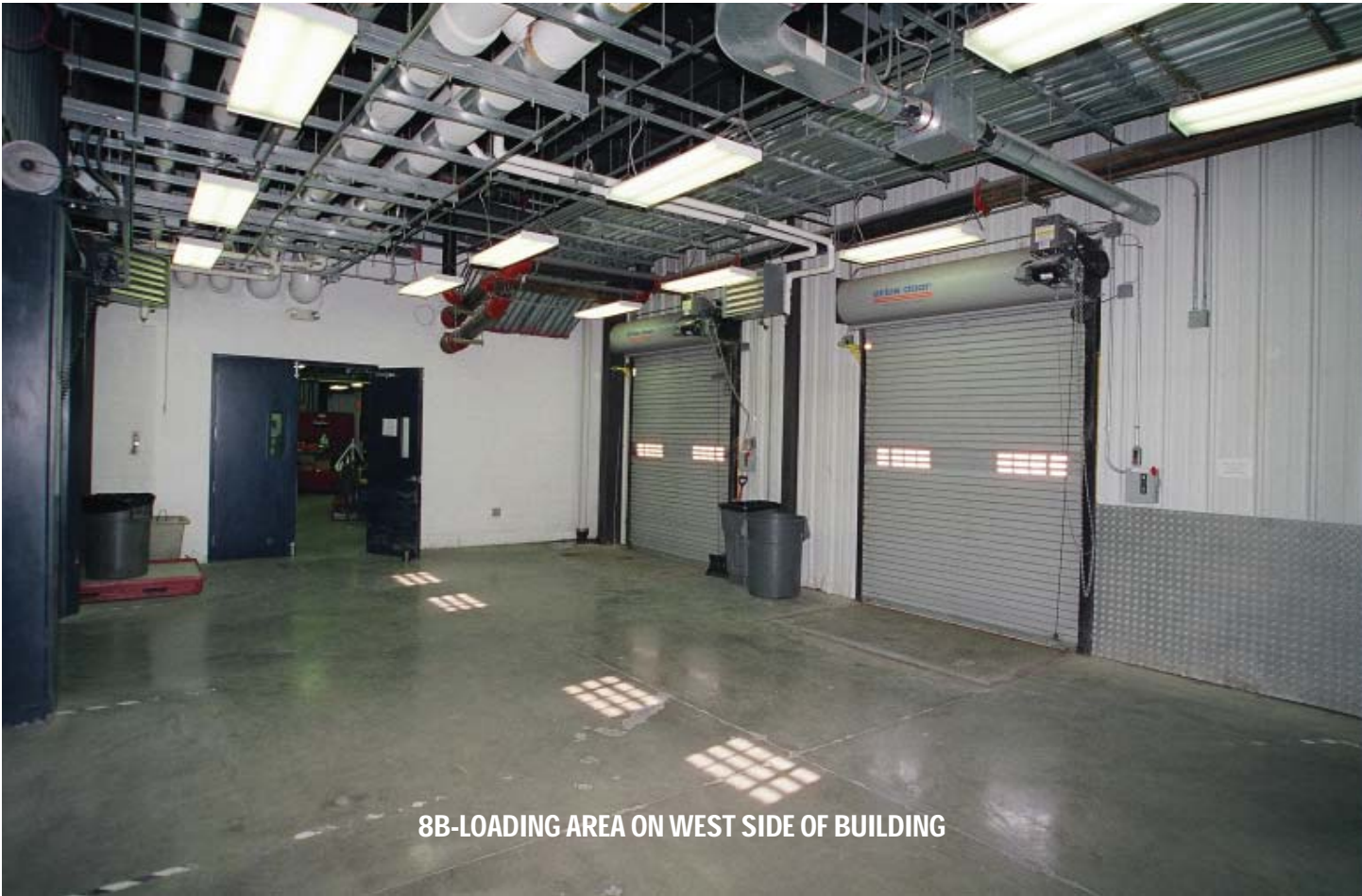
8B-LOADING AREA ON WEST SIDE OF BUILDING