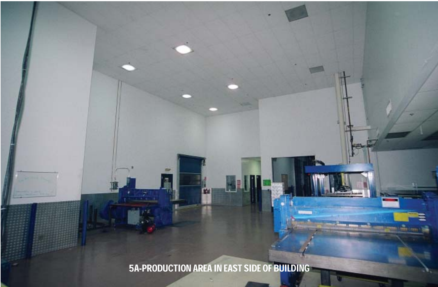
5A-PRODUCTION AREA IN EAST SIDE OF BUILDING