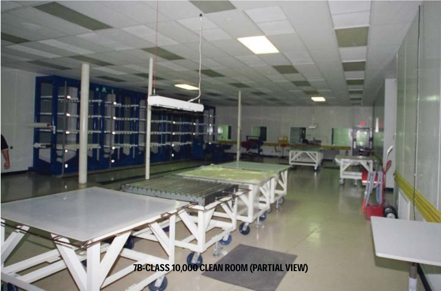
7B-CLASS 10,000 CLEAN ROOM (PARTIAL VIEW)