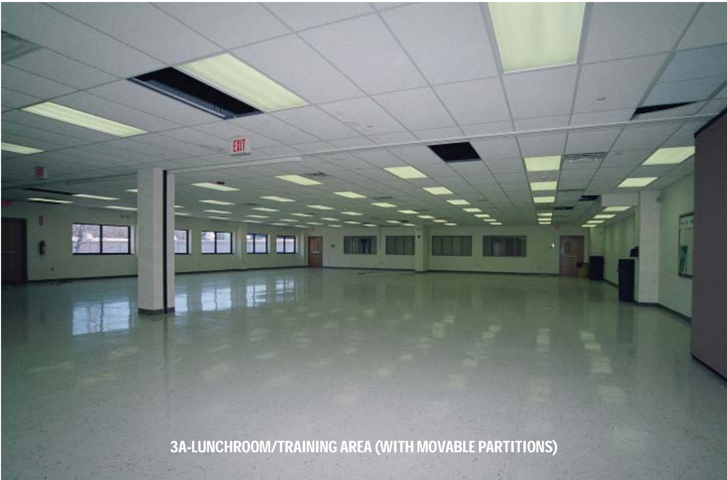
3A-LUNCHROOM/TRAINING AREA (WITH MOVABLE PARTITIONS)