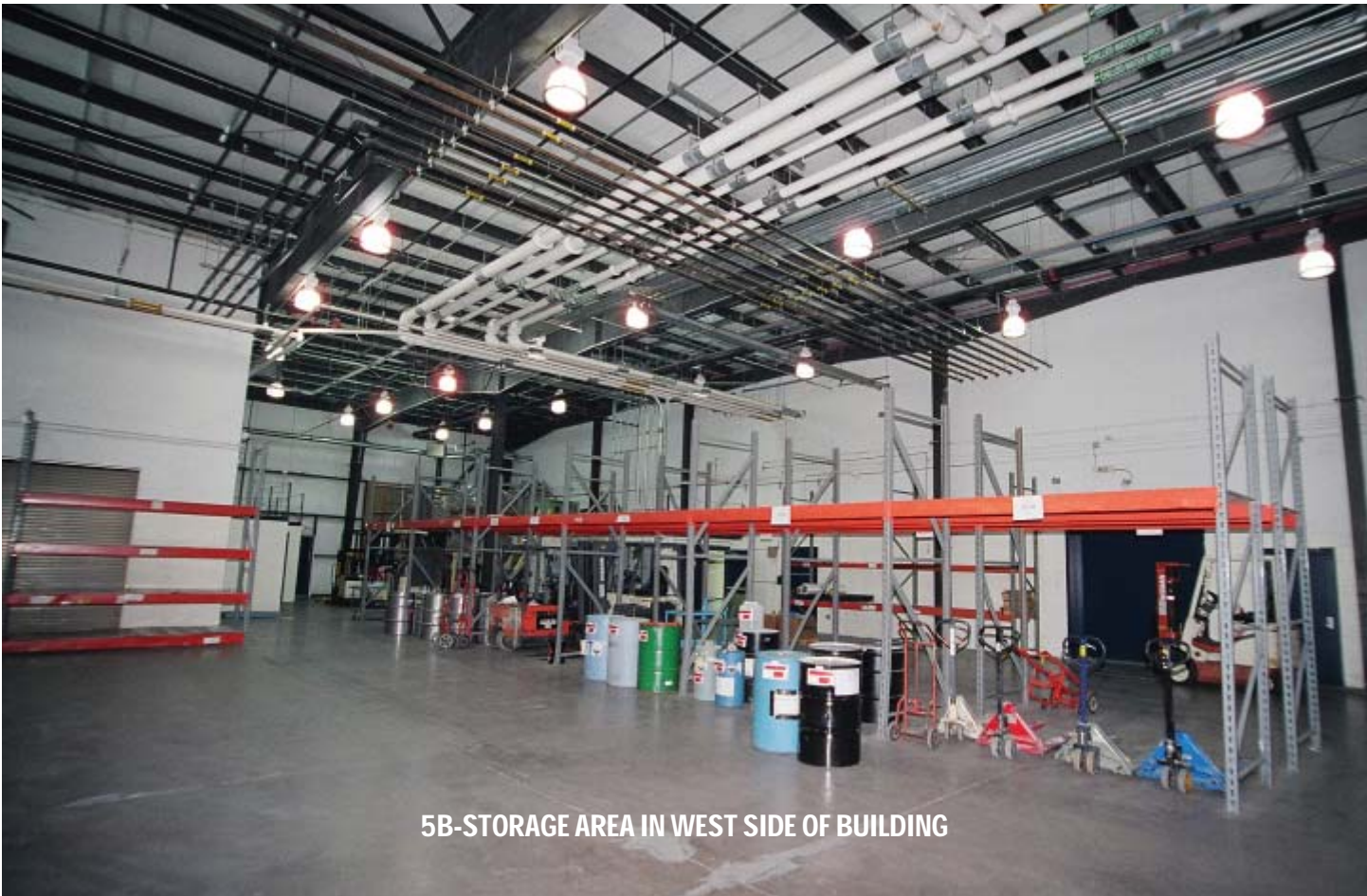
5B-STORAGE AREA IN WEST SIDE OF BUILDING