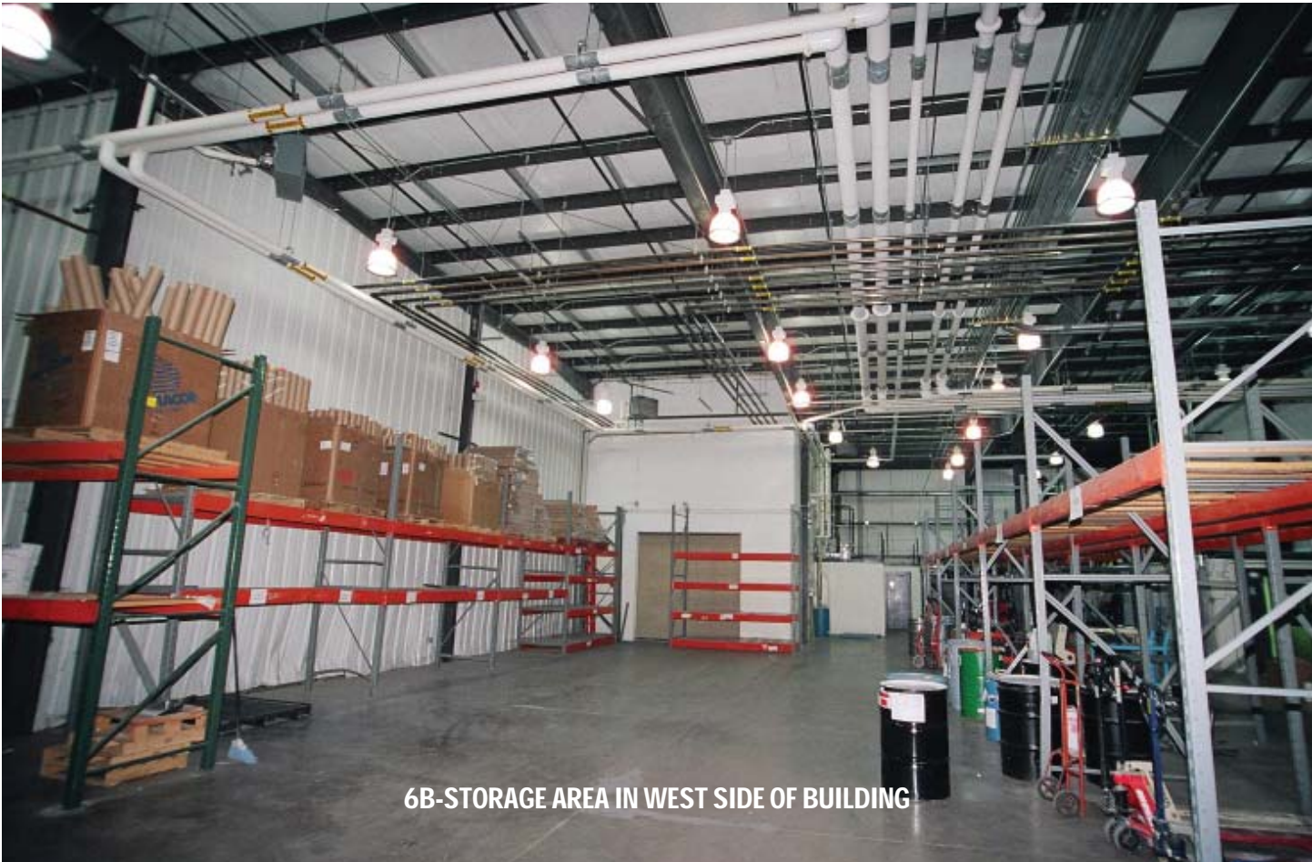
6B-STORAGE AREA IN WEST SIDE OF BUILDING