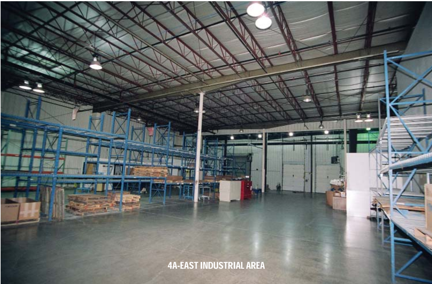
4A-EAST INDUSTRIAL AREA