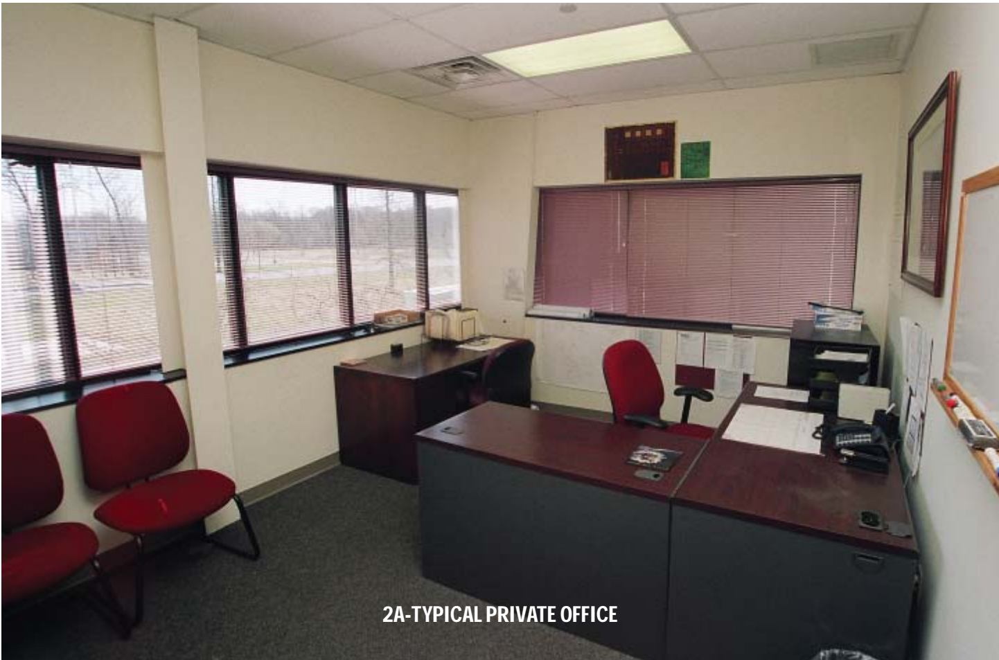
2A-TYPICAL PRIVATE OFFICE