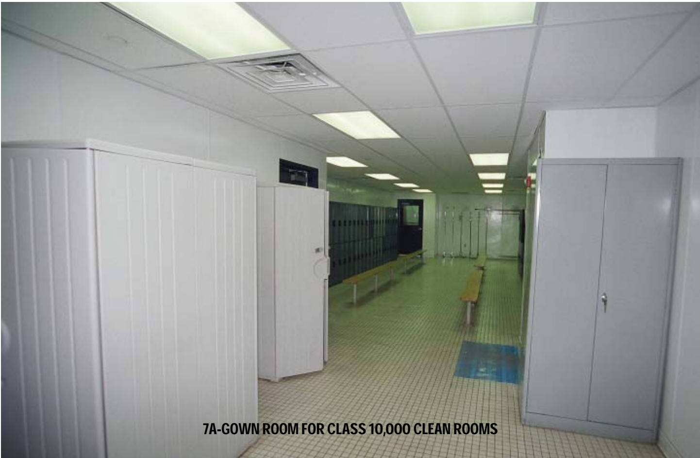
7A-GOWN ROOM FOR CLASS 10,000 CLEAN ROOMS