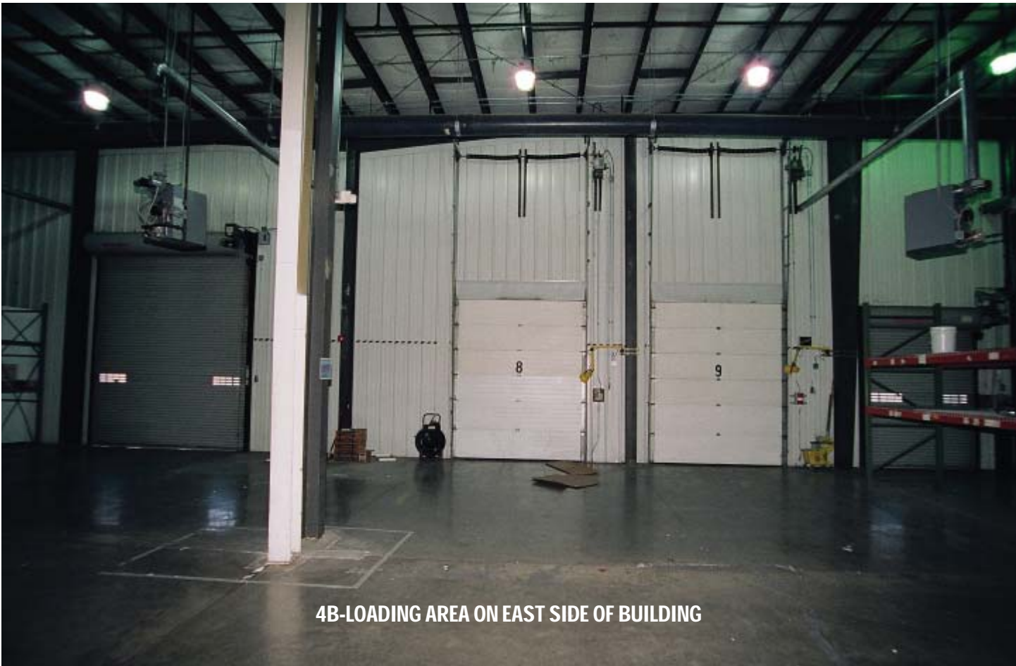
4B-LOADING AREA ON EAST SIDE OF BUILDING