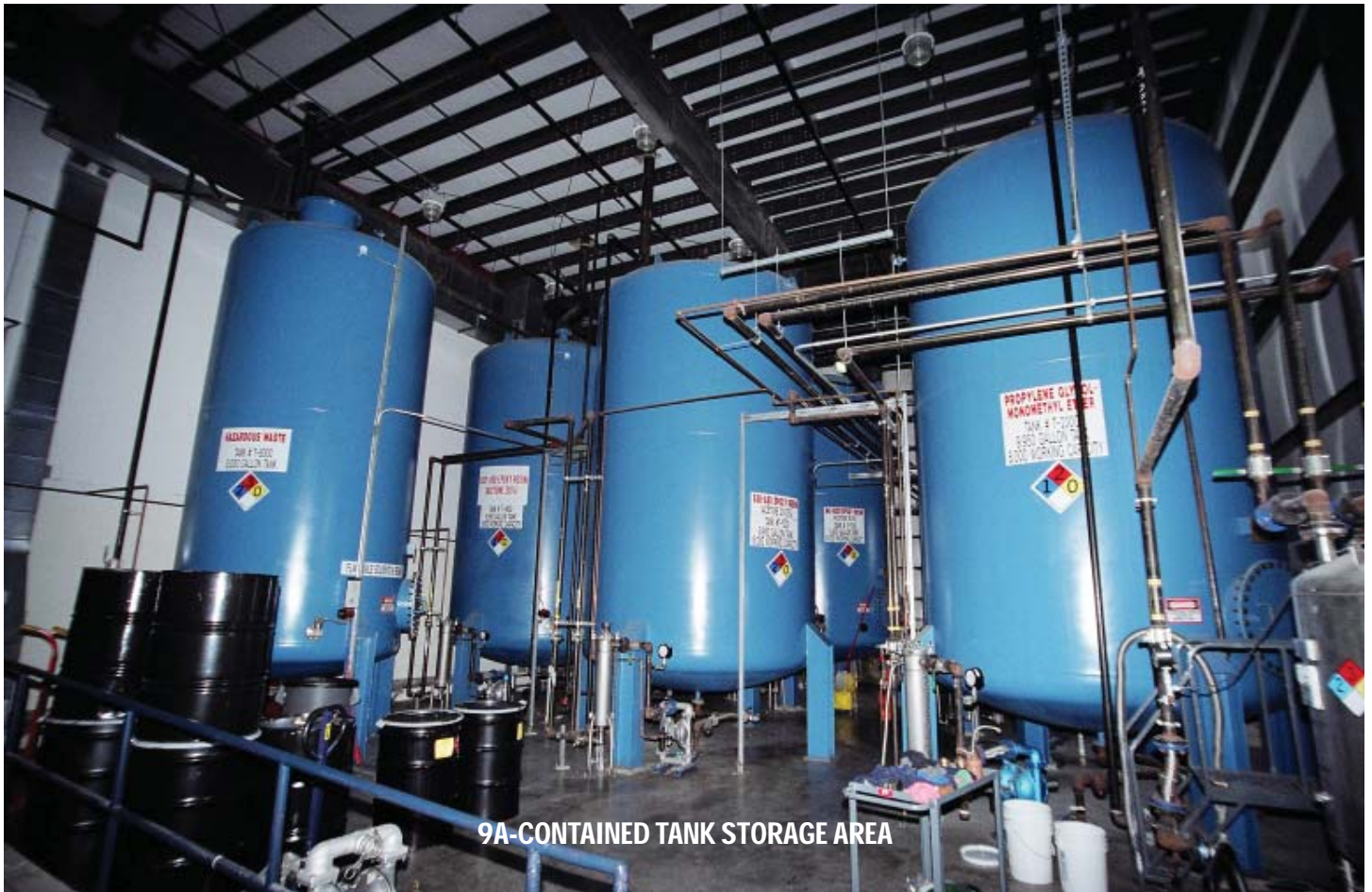
9A-CONTAINED TANK STORAGE AREA