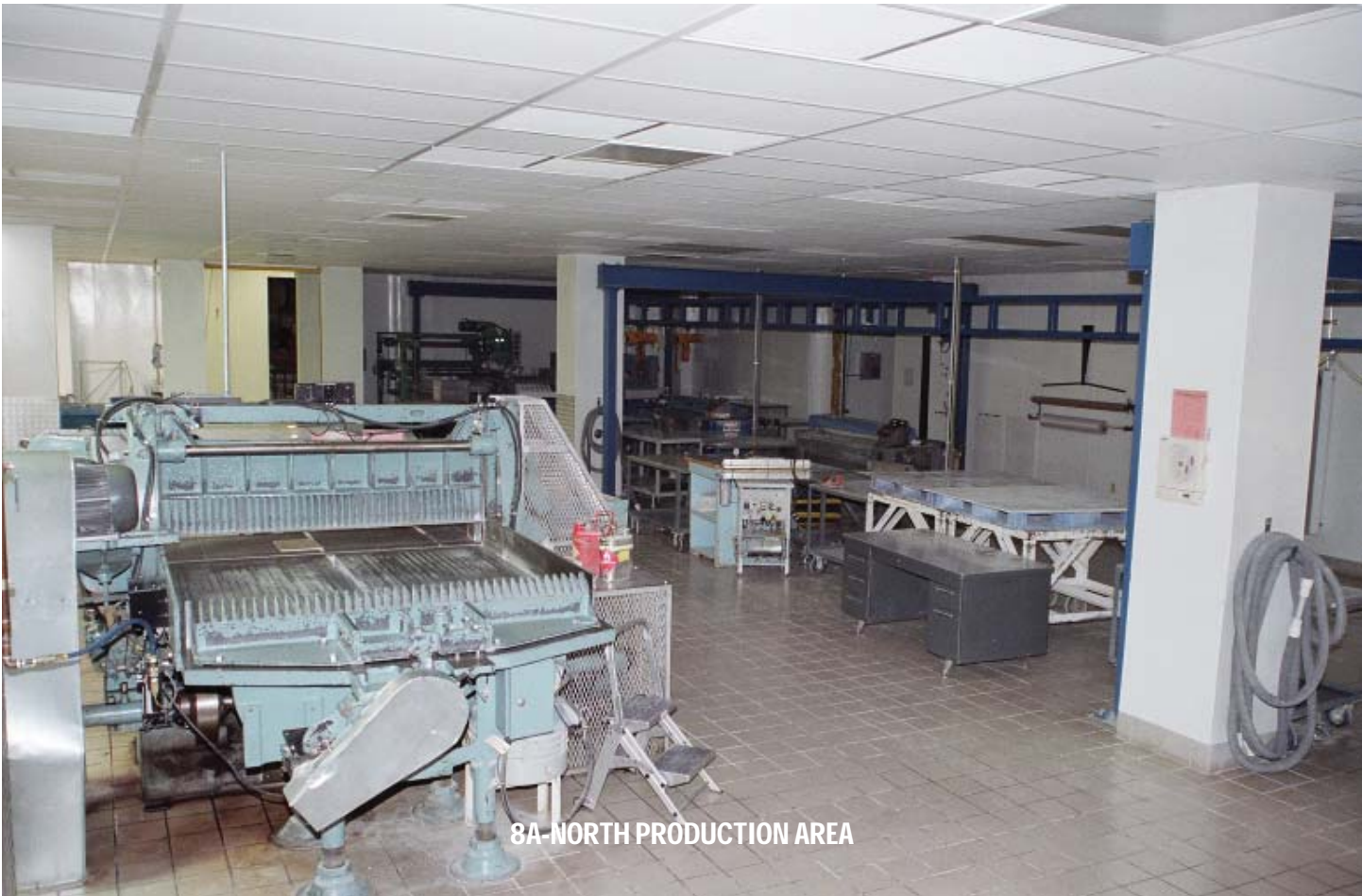
8A-NORTH PRODUCTION AREA