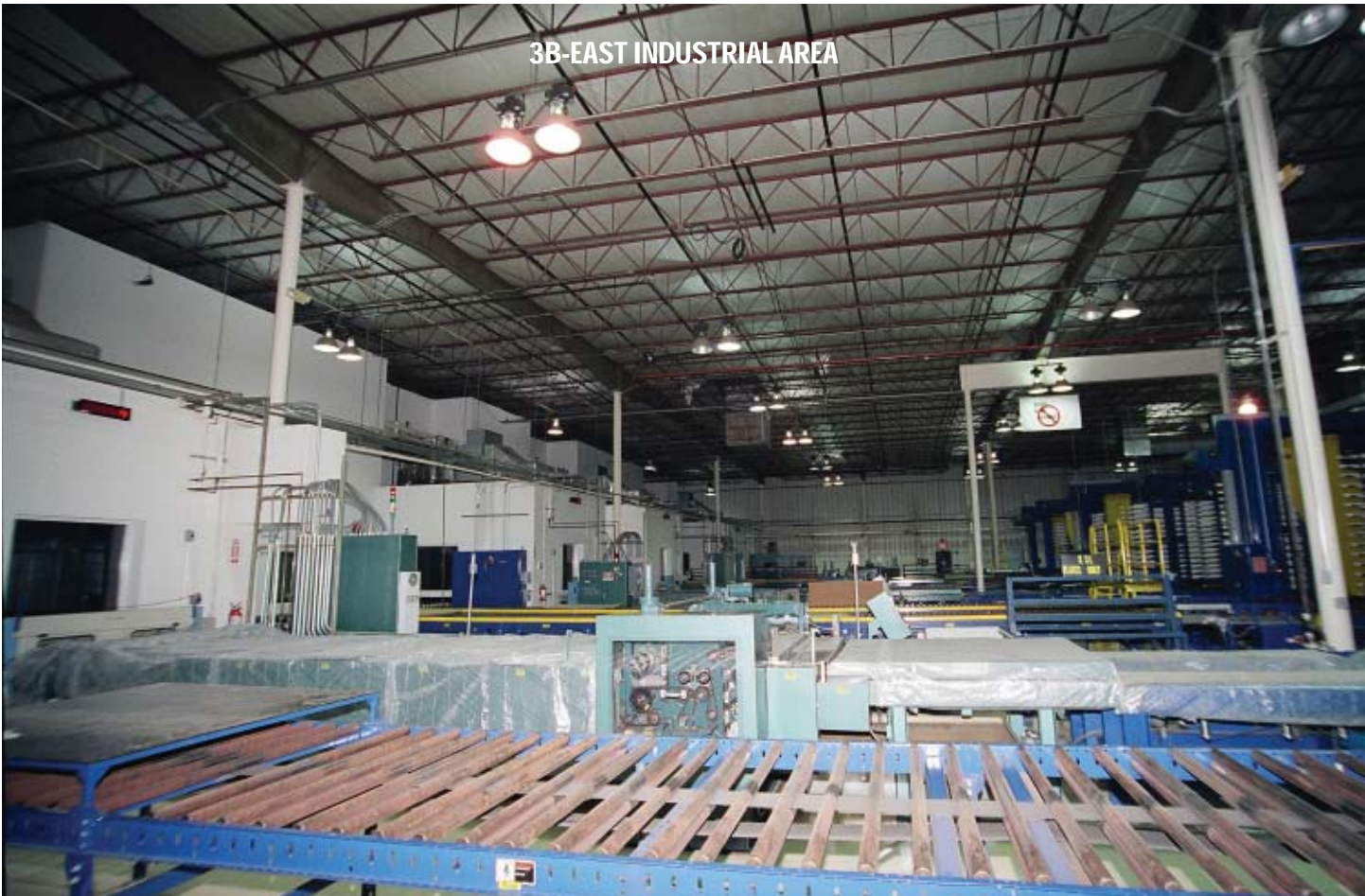
3B-EAST INDUSTRIAL AREA