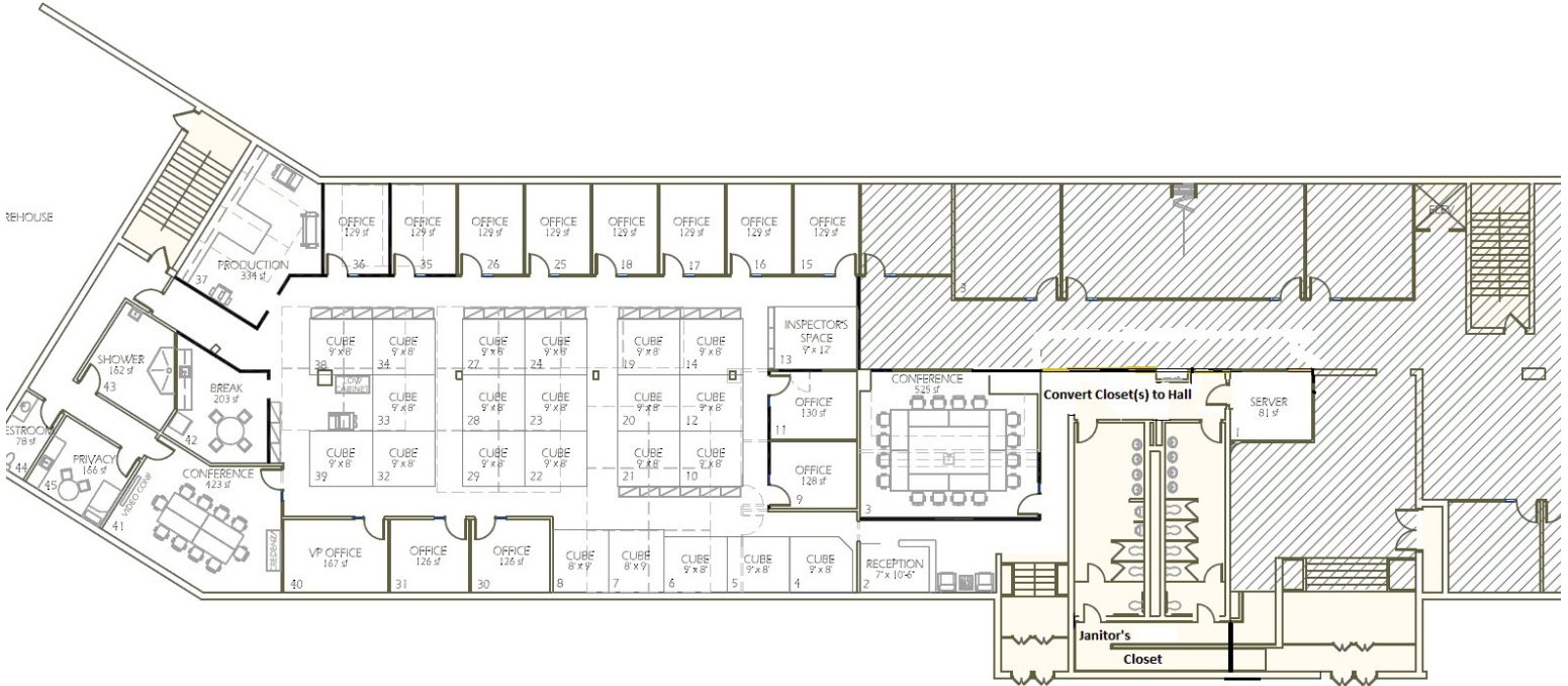
10,100± SF FLOOR PLAN