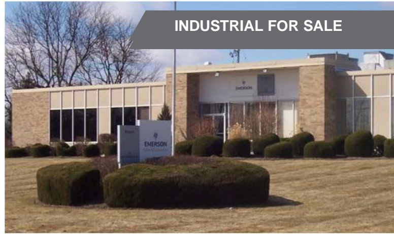
INDUSTRIAL FOR SALE

Cushman & Wakefield Copyright 2020. No warranty or representation, express or implied, is made to the accuracy or completeness of the information contained herein, and same is submitted subject to errors, omissions, change of price, rental or other conditions, withdrawal without notice, and to any special listing conditions imposed by the property owner(s). As applicable, we make no representation as to the condition of the property (or properties) in question.