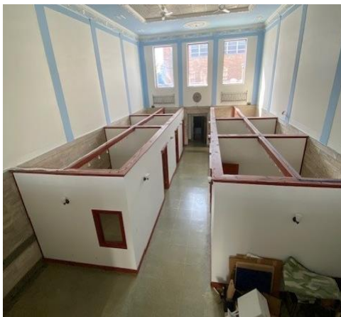
45 Grand Street