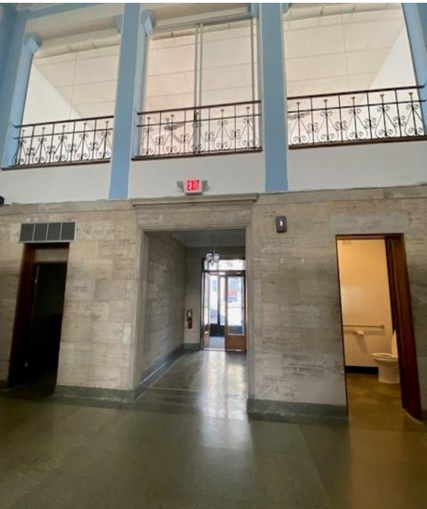
47 Grand Street