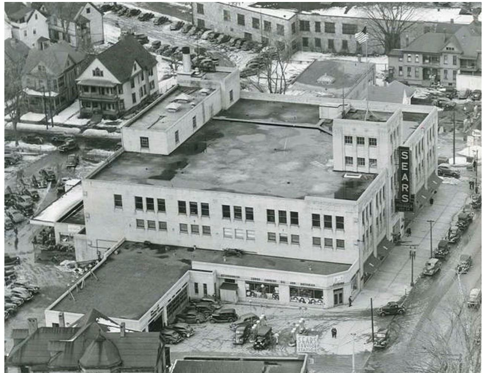
The Sears Roebuck department store on S. Salina St. in Syracuse in the 1940s.