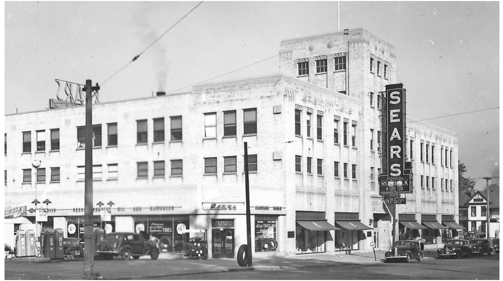
Sears store on S. Salina Street in Syracuse, as seen in the 1930s

The store at 1300 South Salina Street historically represented a significant retail establishment for this national merchandising company in the region and survives today as a rare example of its type in CNY.