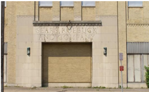
July 2014