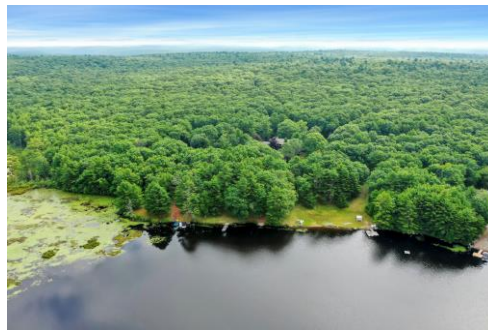
VIEW FROM THE LAKE TO 8 ACRE SITE