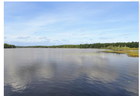
VIEW OF LAKE FROM 8 ACRE SITE