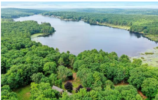
AERIAL VIEW OF MOHICAN LAKE