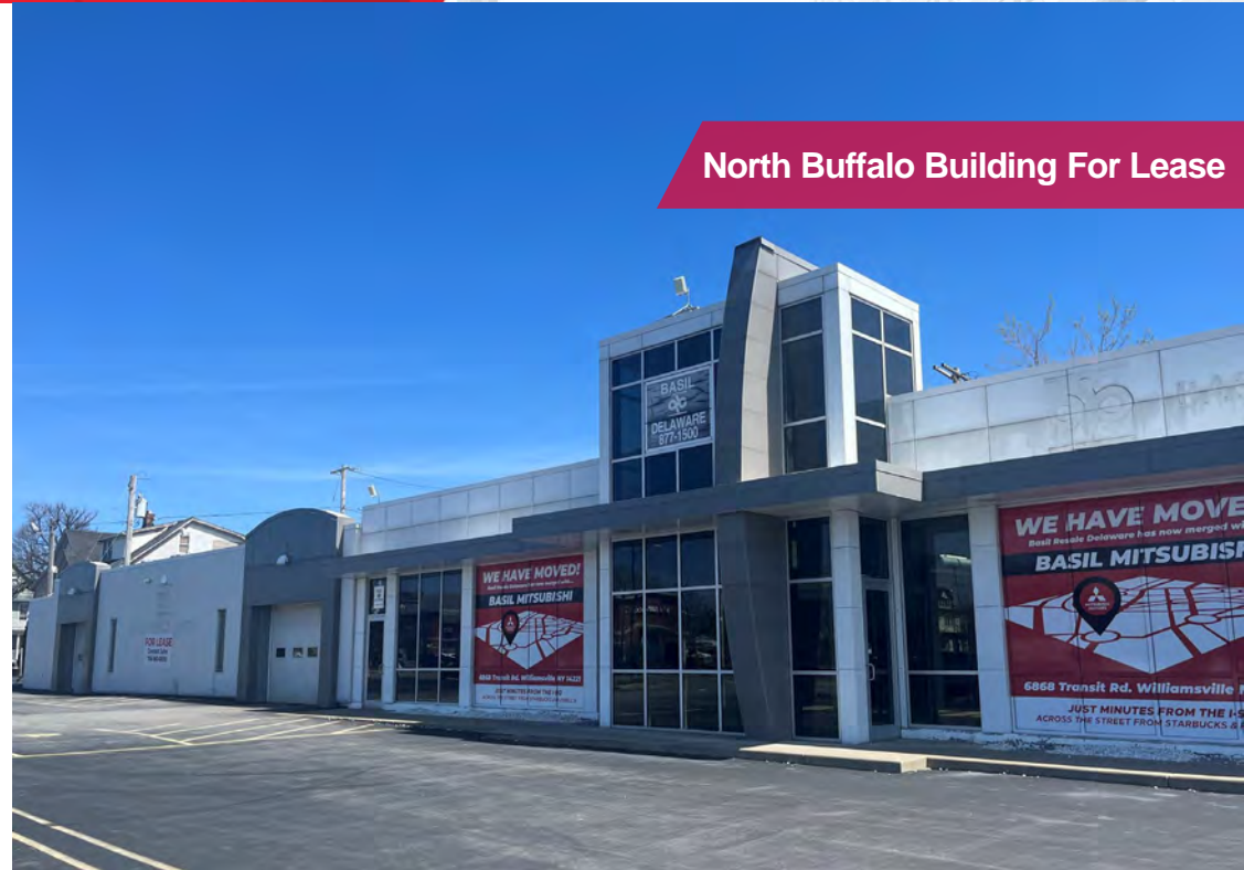
North Buffalo Building For Lease