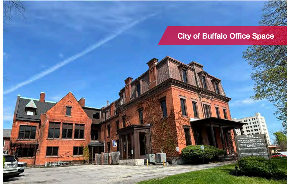
City of Buffalo Office Space