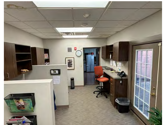
558 Franklin Street Photos