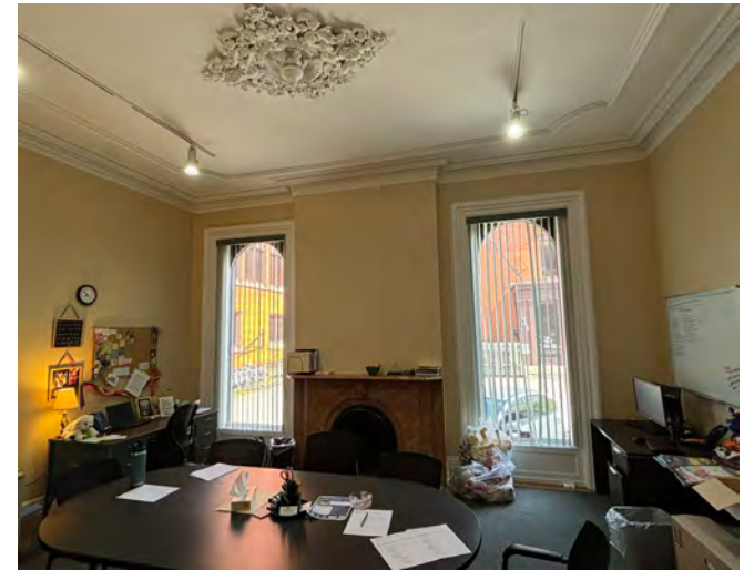
556 Franklin Street Photos