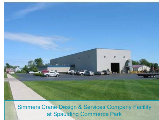
Simmers Crane Design & Services Company Facility at Spaulding Commerce Park