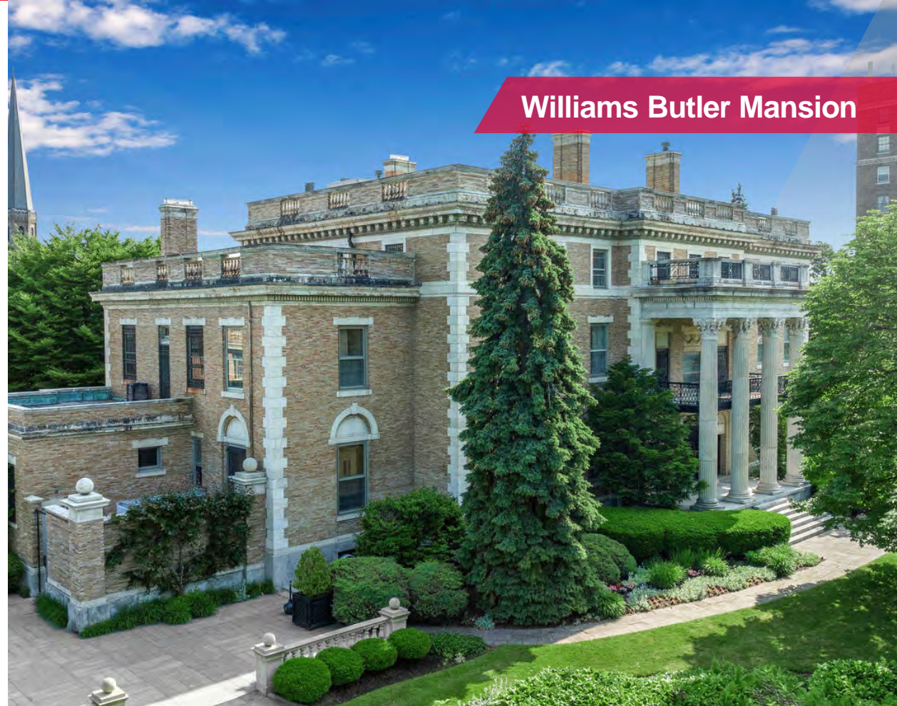
Williams Butler Mansion