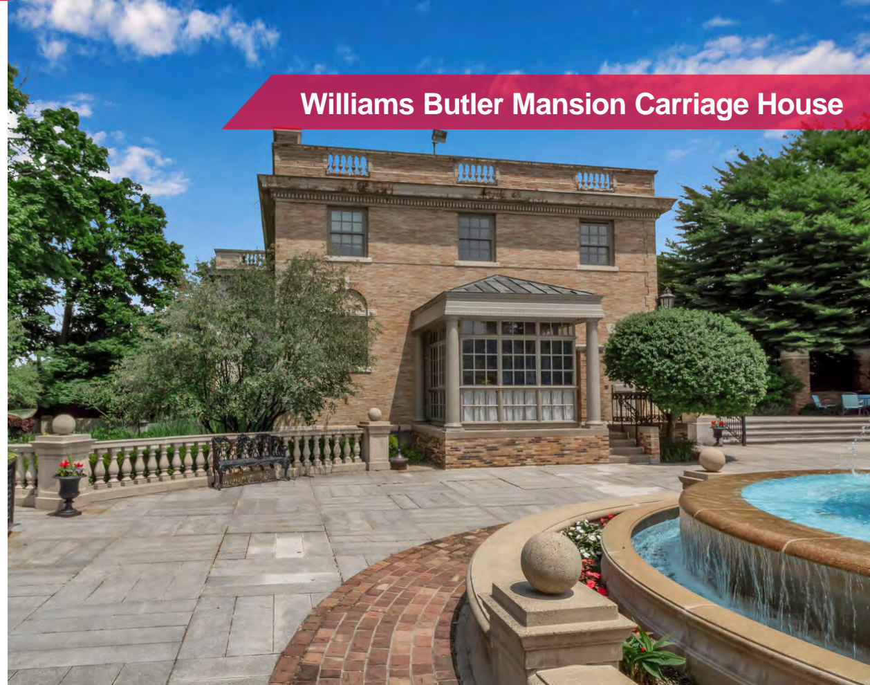
Williams Butler Mansion Carriage House