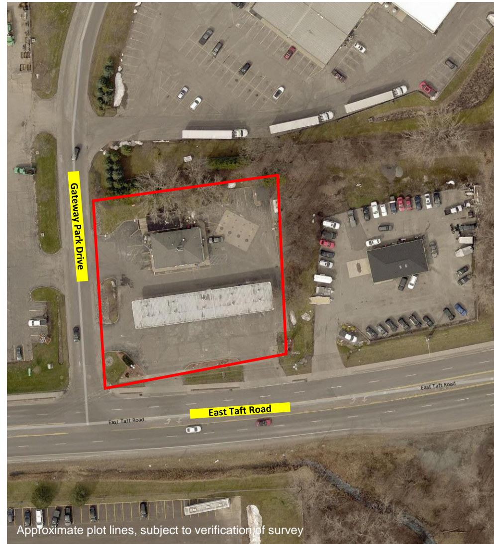
Approximate plot lines, subject to verification of survey