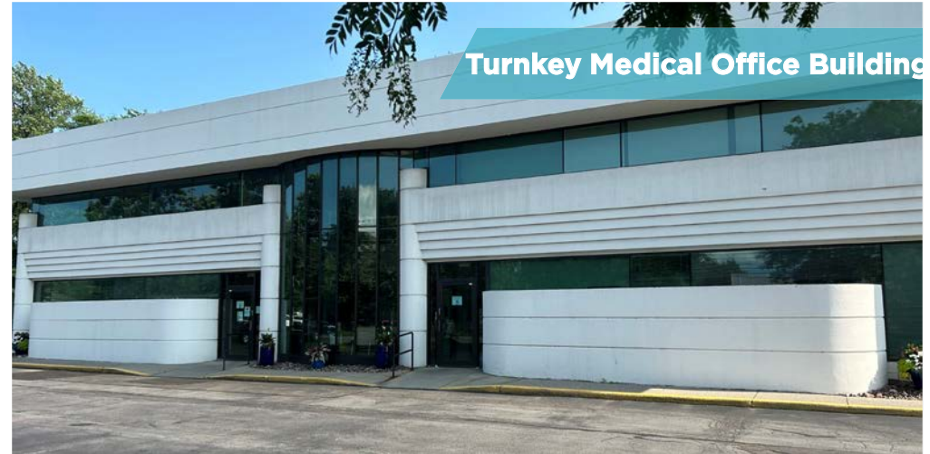
Turnkey Medical Office Building