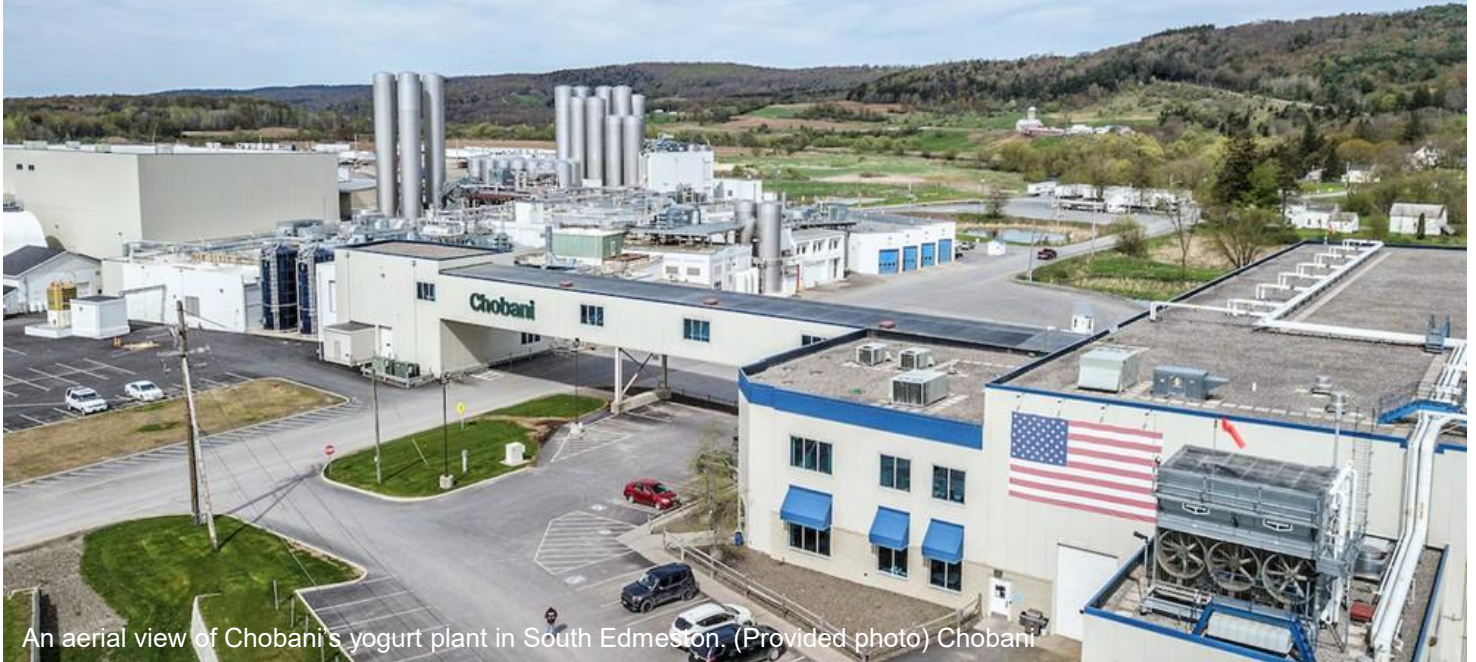
An aerial view of Chobani's yogurt plant in South Edmeston.

Chobani to invest $1.2 billion into building a 1.4 million square-foot dairy processing plant at Griffiss Business and Technology Park — the largest investment in natural food manufacturing in the United States. The Triangle Site, measuring around 332 acres at Griffiss International Airport, will house the new Greek yogurt manufacturing facility. Chobani aims to create more than 1,000 jobs in Oneida County, nearly doubling Chobani's New York State workforce. Read More