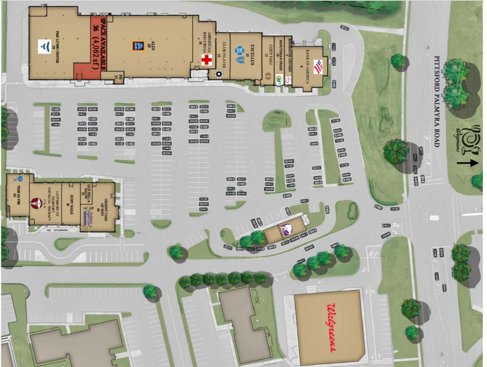
Perinton Hills Shopping Center SITE PLAN NORTH